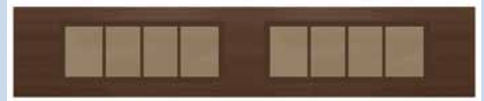
Bronze Tint Glass & Provincial Wide Bronze Muntin Bars