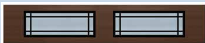
Satin Texture Glass & Regal Wide Black Muntin Bars