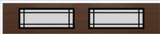
Regal Wide Black Muntin Bars