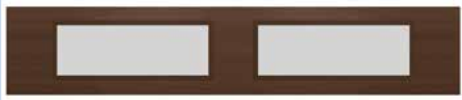
Clear View Sealed Glass