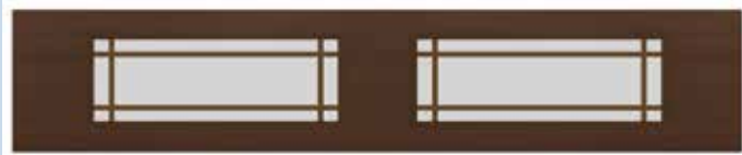
Regal Wide Bronze Muntin Bars