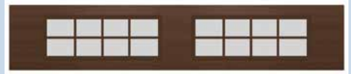
Stanton Wide Bronze Muntin Bars