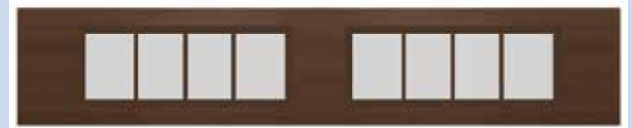
Provincial Wide Bronze Muntin Bars