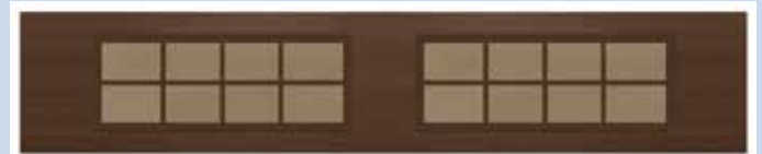
Bronze Tint Glass & Stanton Wide Bronze Muntin Bars