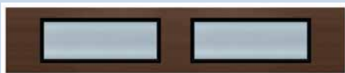
Satin Texture Sealed Glass