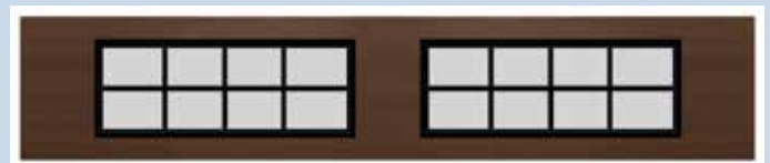
Stanton Wide Black Muntin Bars