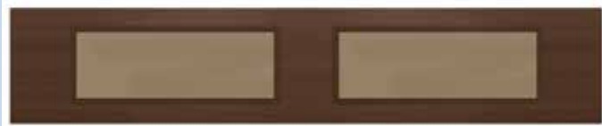
Bronze Tint Sealed Glass