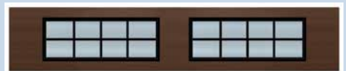
Satin Texture Glass & Stanton Wide Black Muntin Bars