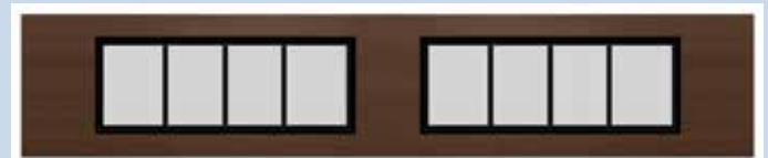
Provincial Wide Black Muntin Bars