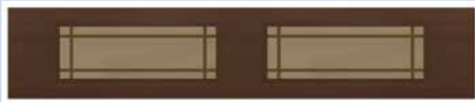
Bronze Tint Glass & Regal Wide Bronze Muntin Bars